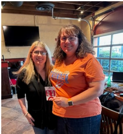
April & May birthday winners